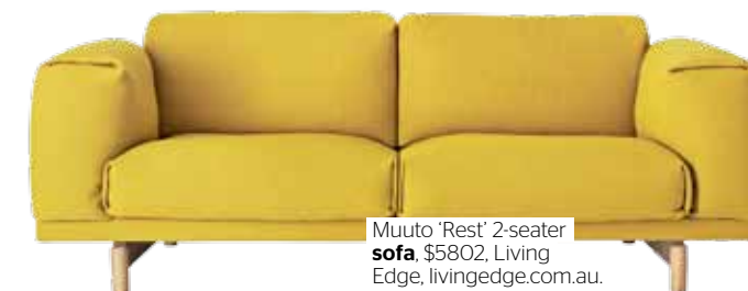
Muuto 'Rest' 2-seater sofa , $5802, Living Edge, livingedge.com.au.

'Clean & Protect' interior paints in Naturalist and Cool Store, $59.90/4L; 'Clean & Protect Kitchen & Bathroom' paint in Freshness, $60.90/4L; all British Paints, 132 525.