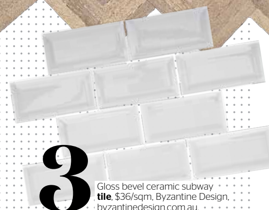
Gloss bevel ceramic subway tile , $36/sqm, Byzantine Design, byzantinedesign.com.au.