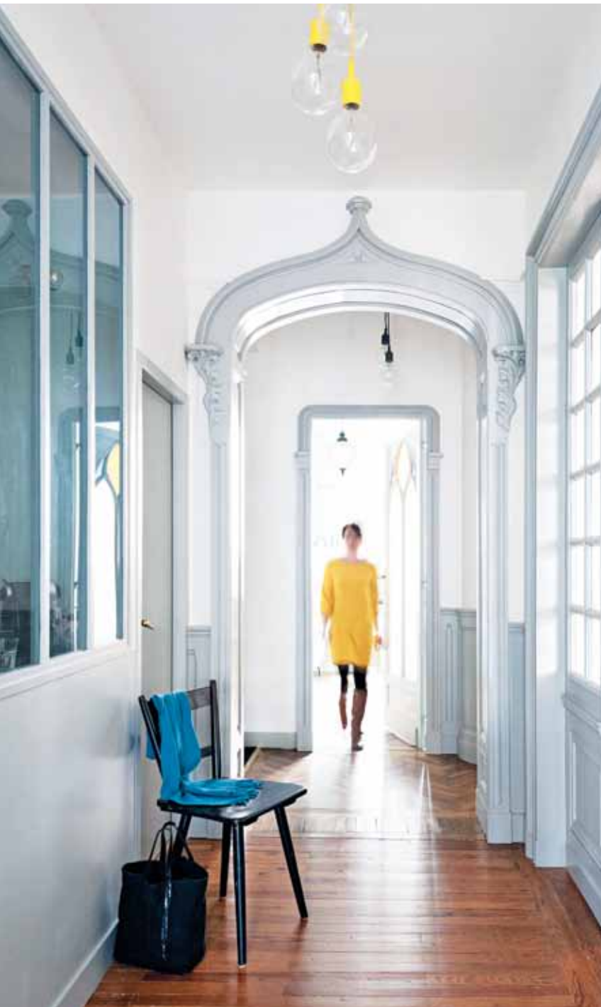
HALLWAY (above) The apartment welcomes visitors with a hallway that has classical doorway details accentuated by a light grey shade. A modern touch comes in the form of a cluster of yellow Muuto 'E27' pendant lights. The black chair was found at a flea market. READING CORNER (above right) At the other end of the raised bow window zone is this cosy space featuring a leather club chair from an antique shop. LIVING ROOM (opposite) The original parquet floor has been carefully restored to a warm finish, complementing the furniture and decorative mouldings.