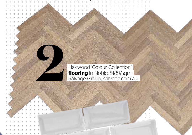
Hakwood 'Colour Collection' flooring in Noble, $189/sqm, Salvage Group, salvage.com.au.