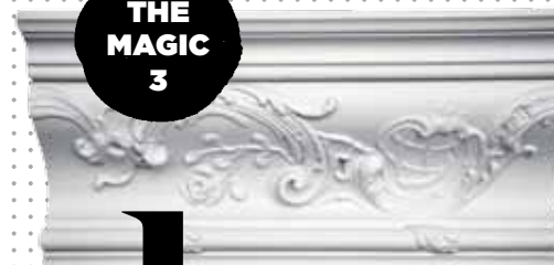
'FRC004' plaster cornice , $21.60/lineal metre, Bailey Interiors, baileyinteriors.com.au.